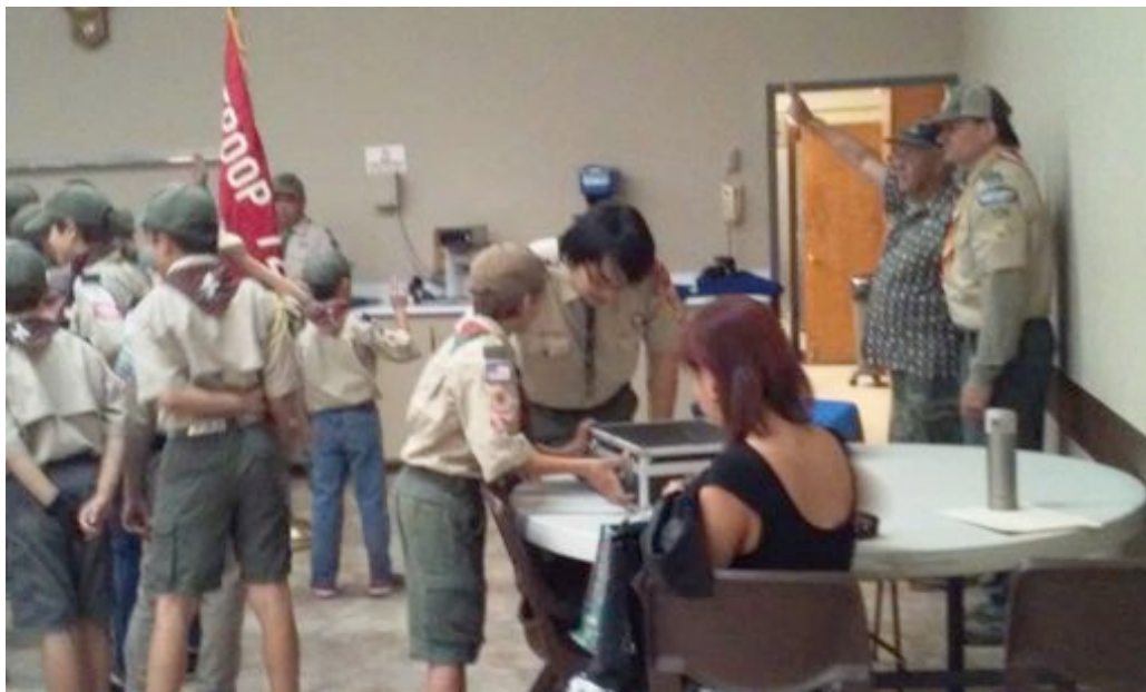
Those adult leaders- always busy at work.... Do they ever rest???