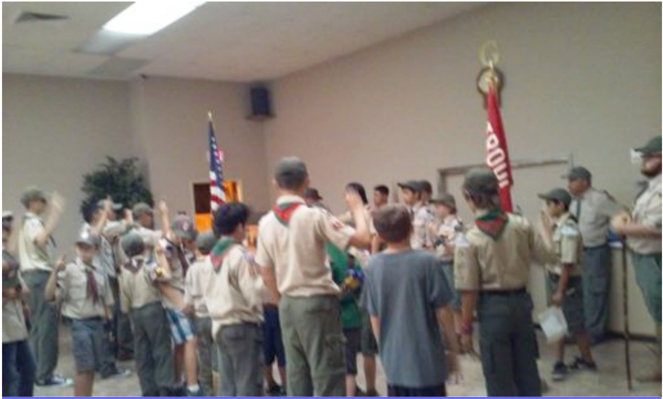
Troop Formation!!!! Webelos in Toe