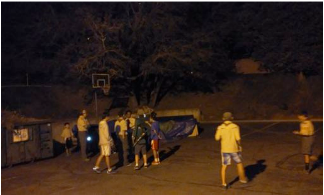
Webelos Fun Night Continues Behind the Masonic Center....